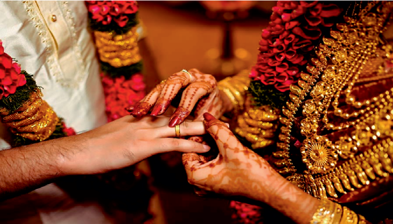
# Happy Ring Ceremony