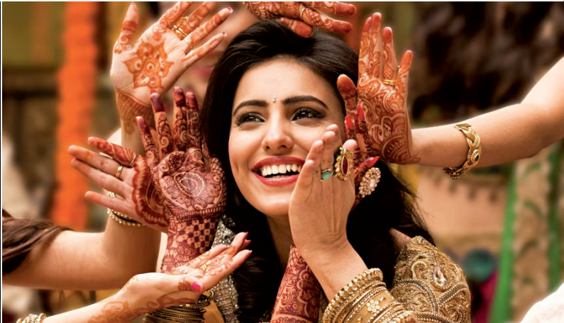
# Happy Mehndi