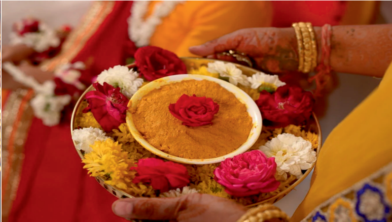
# Happy Haldi