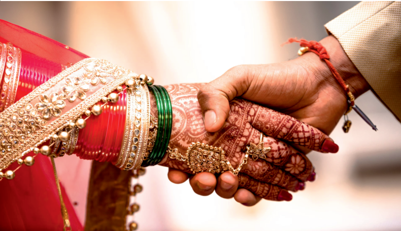
# Happy Wedding