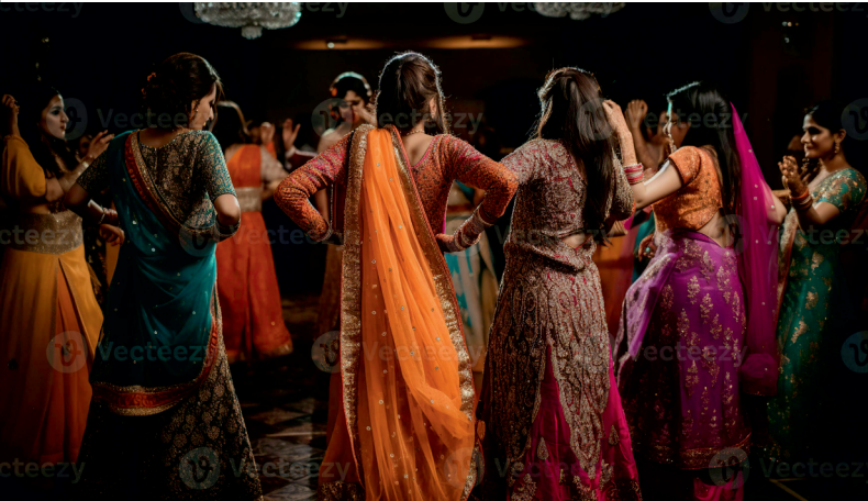
# Happy Sangeet